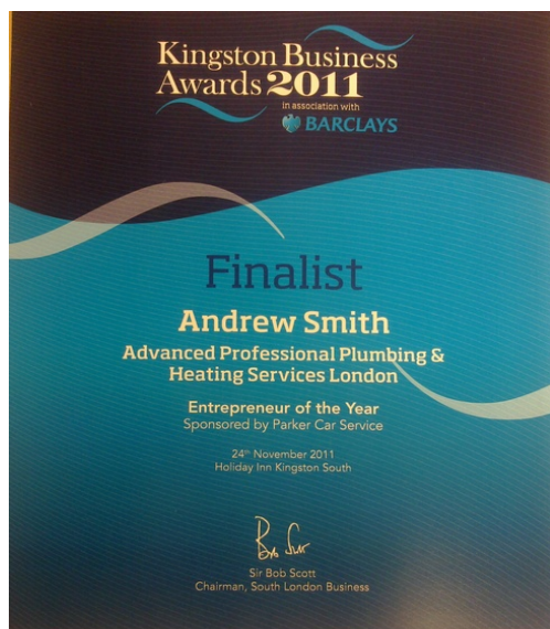
Kingston Business Awards 2011 of the year “ (Kingston Business Awards)